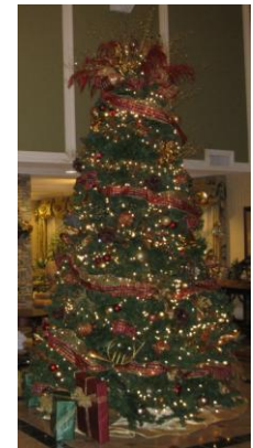
St. George Tree