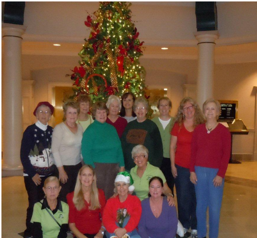
Worker bees after decorating the City Hall "Frog Tree"